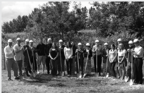
WHS students joined design engineers and elected officials at the future site of the pedestrian tunnel.

This project is the result of cooperation and planning between public and private organizations, including a partnership between the Port of Camas-Washougal, the Army Corps of Engineers, Washington State Department of Transportation, the City of Washougal, Pendleton Woolen Mills, and the local, state and federal government.