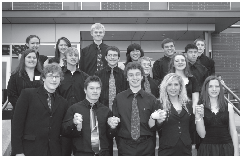
Members of the WHS band.

The WHS Wind Ensemble performed at the Lower Columbia River Band festival at Mountain View High School. The band placed 2nd out of 15 Clark County High