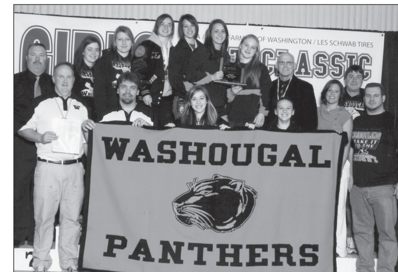
Washougal Girls Wrestling Team