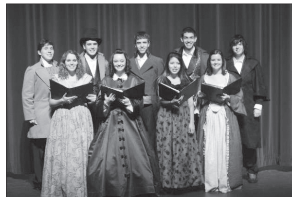
Washougal High School X-tet

WHS's renowned a capella group, X-Tet , performed at several community events, including the Washougal Tree Lighting, Camas Hometown Holidays, the Christmas Ships Launch at the Port of Camas-Washougal, the ESD 112 Christmas party and the Riverview Bank Christmas party.