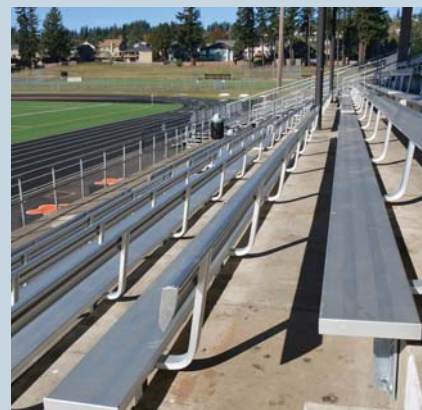
The new aluminum Panther seating replaces wooden seats that needed frequent, costly maintenance.