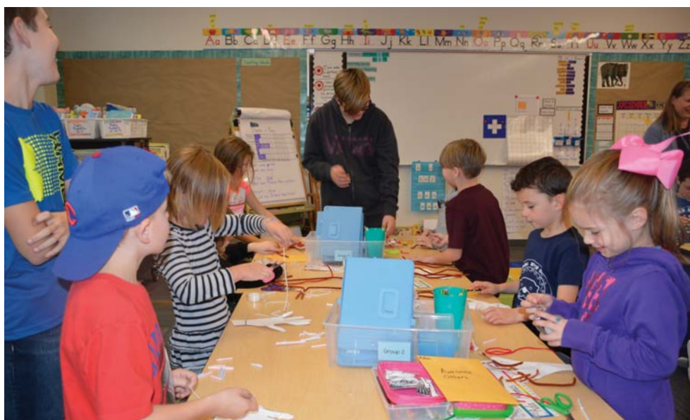
Above and upper right: JMS students guide CRGE first grade students as they explore how a human hand works.