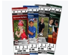
Ticket Magnet or Poster