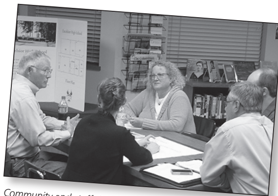
Community and staff discuss the future of the district's facilities at a recent forum.

The committee consisted of 18 members representing Washougal area citizens, district staff, two school board members and other individuals with