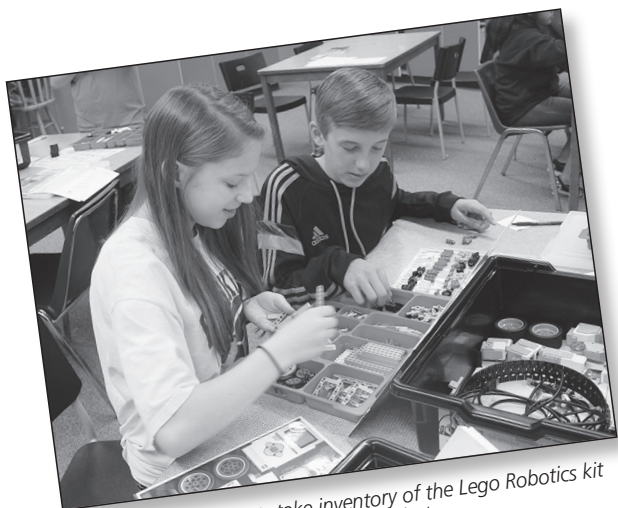
Middle school students take inventory of the Lego Robotics kit they'll use to build a programmable robot.

The Board of Directors will hold a special meeting for facilities discussion on Wednesday, November 12, at 6:30 p.m. at the District Office.