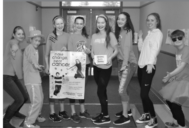
Canyon Creek MS students raised $1,600 to help support blood cancer research.