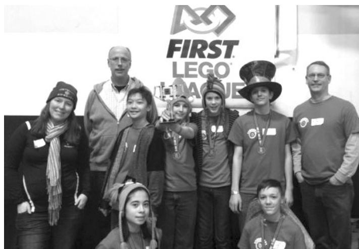
The Robiobots at the First Lego League competition.