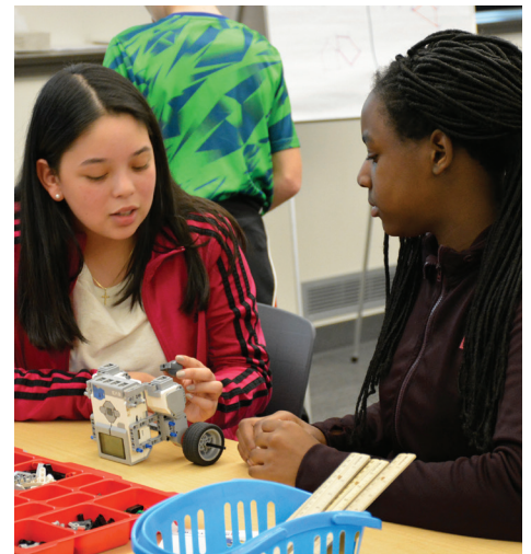
JMS students are excited to stay after school for the fun and challenge of learning about robotics.