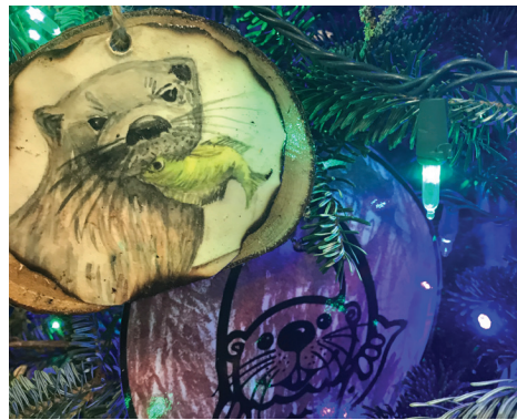
The Papa's Choice Award went to this beautiful tree designed by Columbia River Gorge Elementary staff, featuring hand-made ornaments with the school's mascot—the river otter!

Sponsored by the Washougal Lions Club, this event is a family favorite. This year $13,419.30 was raised through the sale of decorated trees and gift baskets. All proceeds benefit Washougal schools. 🌿