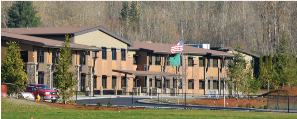
The new Jemtegaard Middle School and Columbia River Gorge Elementary opened in Fall 2017. Additional facilities improvements are coming soon to other district schools.