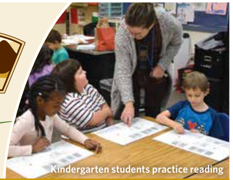
Kindergarten students practice reading