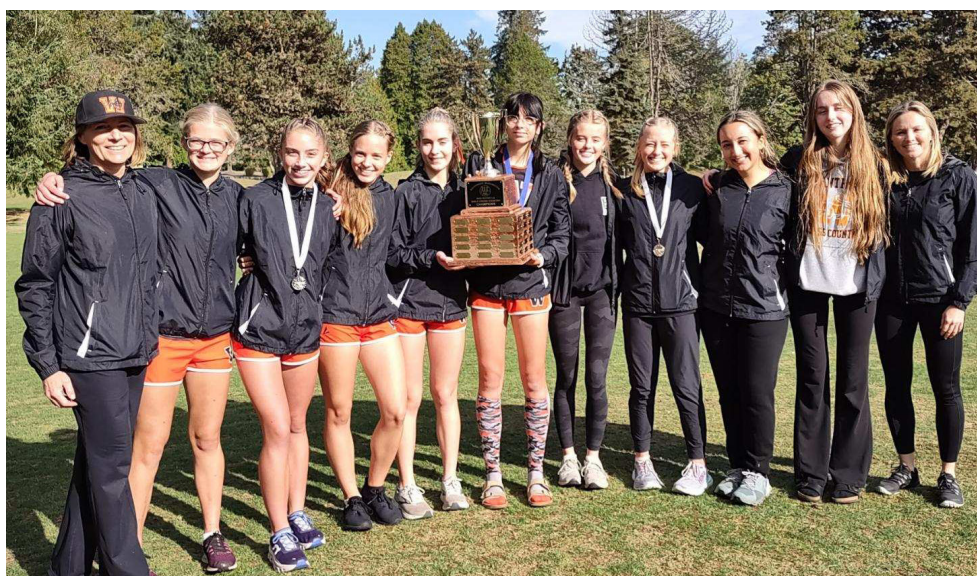
TOP RIGHT: This year, Washougal High School football players were league champions for the first time since 1999, and hosted their first home playoff football game since 1994. ABOVE: Washougal High School cross country runners advance to the District 4 Girls Cross Country Championship.