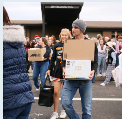
Boxes of food donated at Jemtegaard Middle School are loaded onto the truck for delivery to Children's Home Society in Washougal.

Stuff the Bus has been an annual tradition for over 15 years. The food drive engages Washougal School District students with their community, shaping civic-minded individuals. On average, the Washougal and Camas communities combined donate 40,000 lbs of food for this event each year!